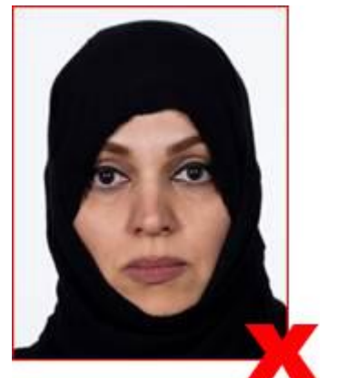
Eyes/edges of face obscured