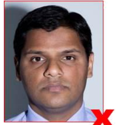
Shadows on image and background

© Photo Requirements | Australian Passport Office