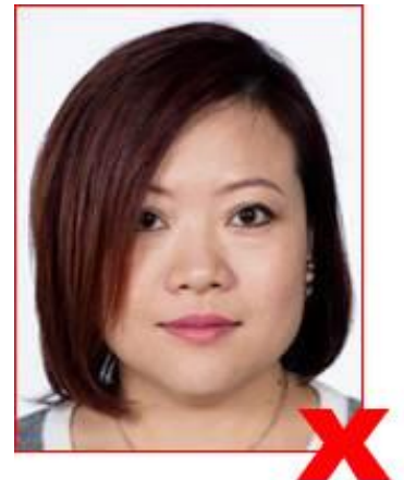
Hair obscuring face