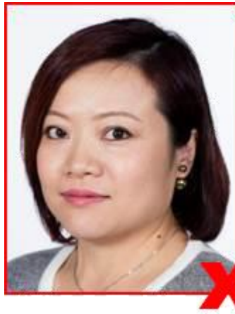
Side on to camera