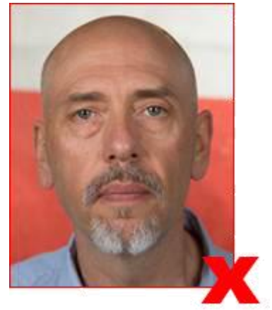
Background not plain