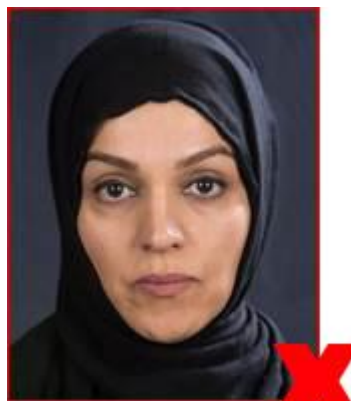
Background too dark